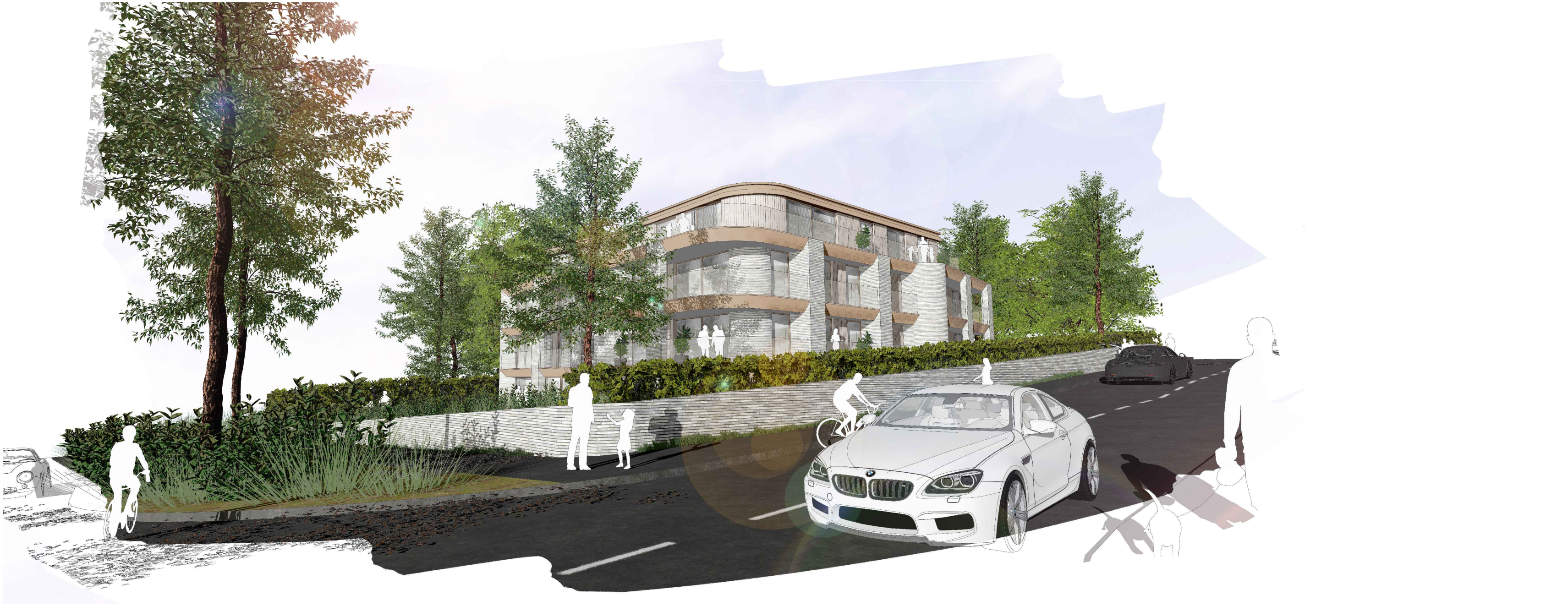
3D VIEW 1 SCALE NTS

MECHANICAL SMOKE EXTRACTION Mechanical smoke extraction to fire lobbies may be required and should be designed by a specialist - client should appoint a qualified Fire Consultant as soon as possible to confirm requirements, spec and constraints.